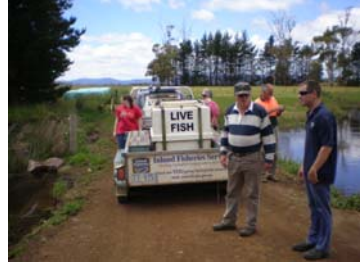
Arrival at Peter's dam

It started off with the IFS-team waiting at the wrong roundabout in Latrobe . The fish in the tank don't like the change of movement of the water. It is best to keep the vehicle moving from the start of the trip to the location where the fish are released. Luckily our fish didn't mind that changes.